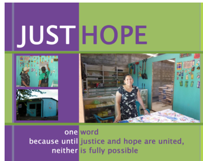
Dreaming Together Hardware Store

The holidays are almost here! Check out this year's NEW Gifts of Hope and make your holiday shopping easier!